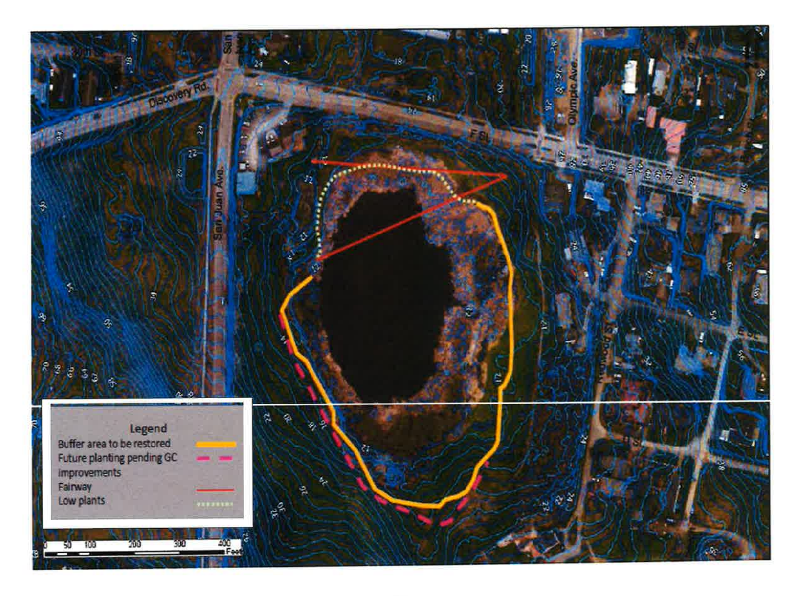
EXHIBIT D Golf Park Pond Area