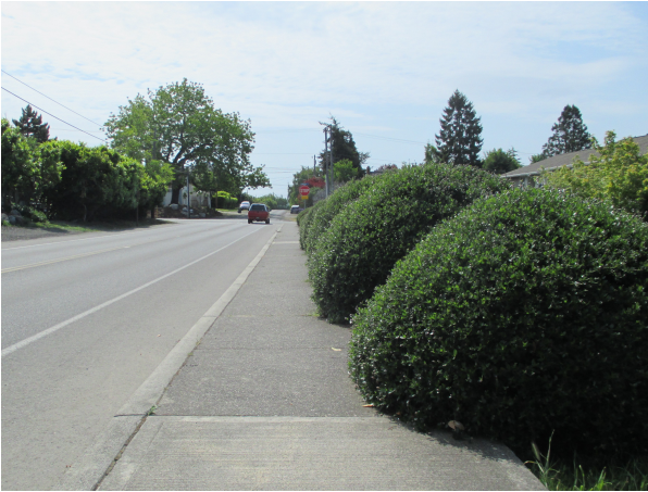
Unmaintained sidewalk blocks pedestrian and wheelchair access.