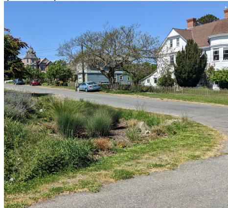
Rain Garden with low vegetation allows for clear sight lines at intersection

For ROW on or near shorelines, wetlands, steep slopes, and other critical areas: Contact the city before maintaining or removing vegetation. A critical area permit may be required.