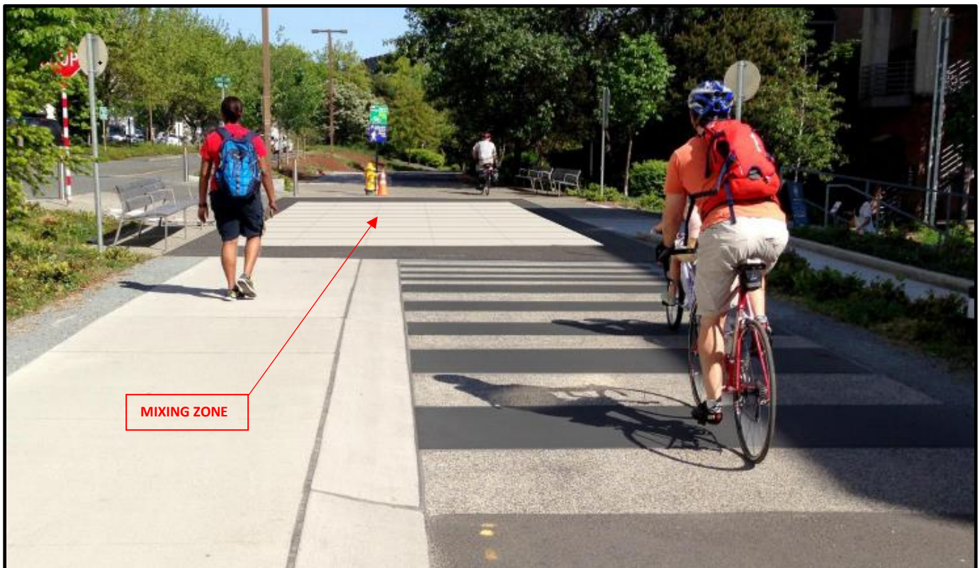
Example image of a mixing zone.

There are a few points along the project corridor where the path of travel for bicyclists and pedestrians will intersect. These points are called “mixing zones”. At these locations, it will be important for cyclists to move slowly and for pedestrians to be aware that bicycles could be present. To remind users to be mindful of others, the mixing zones will have a distinct surface pattern and the borders will be pigmented. They will look similar to this: