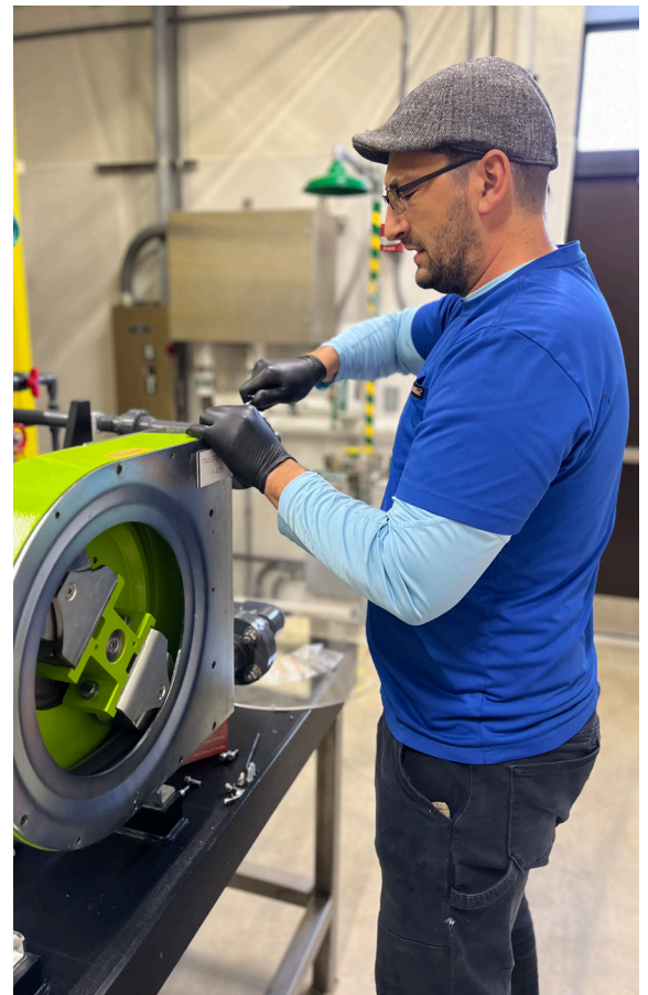
Top: Pre-filtration screens at the Water Treatment Facility. Above: Operator servicing a chlorine pump.

City Lake. The City has worked in cooperation with the U.S. Forest Service for over 90 years to manage and protect our municipal watershed and maintain high quality source water. More information on Source Water is available through the Source Water Assessment Program (SWAP). Visit: tinyurl.com/mpza5cs4 .