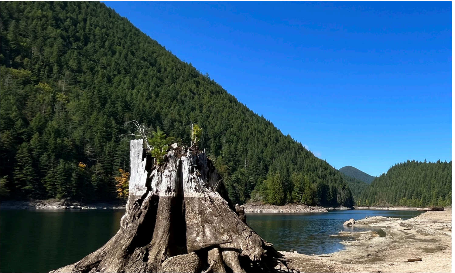
Lords Lake Reservoir in late summer.