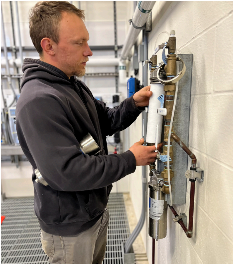
Above: Operator performing preventative maintenance at the Water Treatment Facility. Below: Membrane filtration equipment.

To ensure tap water is safe to drink, the Department of Health and EPA prescribe regulations that limit the amount of certain contaminants in water provided by public water systems. The Food and Drug Administration (FDA) and the Washington Department of Agriculture regulations establish limits for contaminants in bottled water, which must provide the same protection for public health.