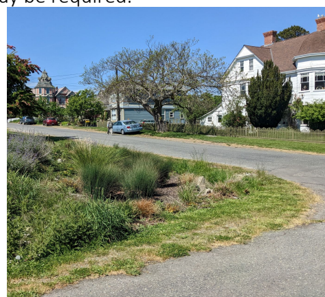
Rain Garden with low vegetation allows for clear sight lines at intersection

For ROW on or near shorelines, wetlands, steep slopes, and other critical areas: Contact the city before maintaining or removing vegetation. A critical area permit may be required.