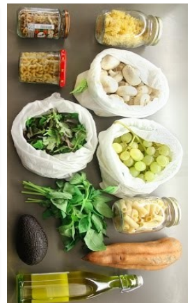
Zero Waste Shopping