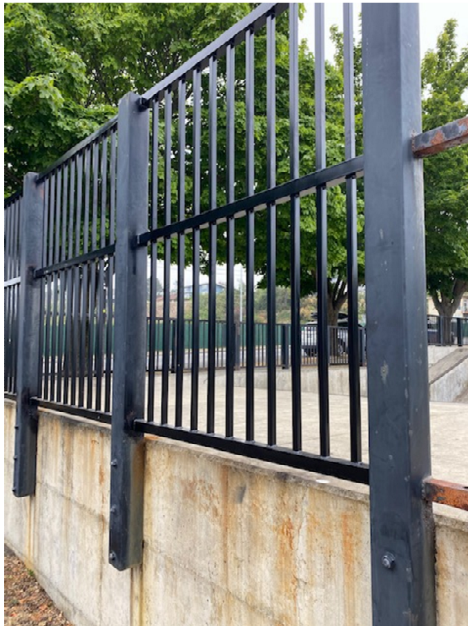
Closeup of Replaced Panel with New Steel Out of 361 lineal feet, 130 lineal feet have been replaced with new panels. New steel panels are lightly painted with spray paint.