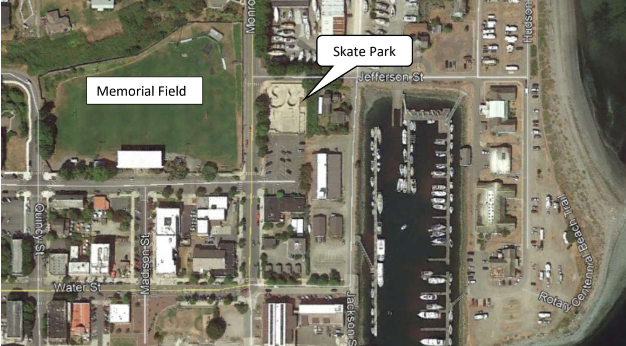
Vicinity Map – Downtown Port Townsend (Intersection of Jefferson St. and Monroe St.)