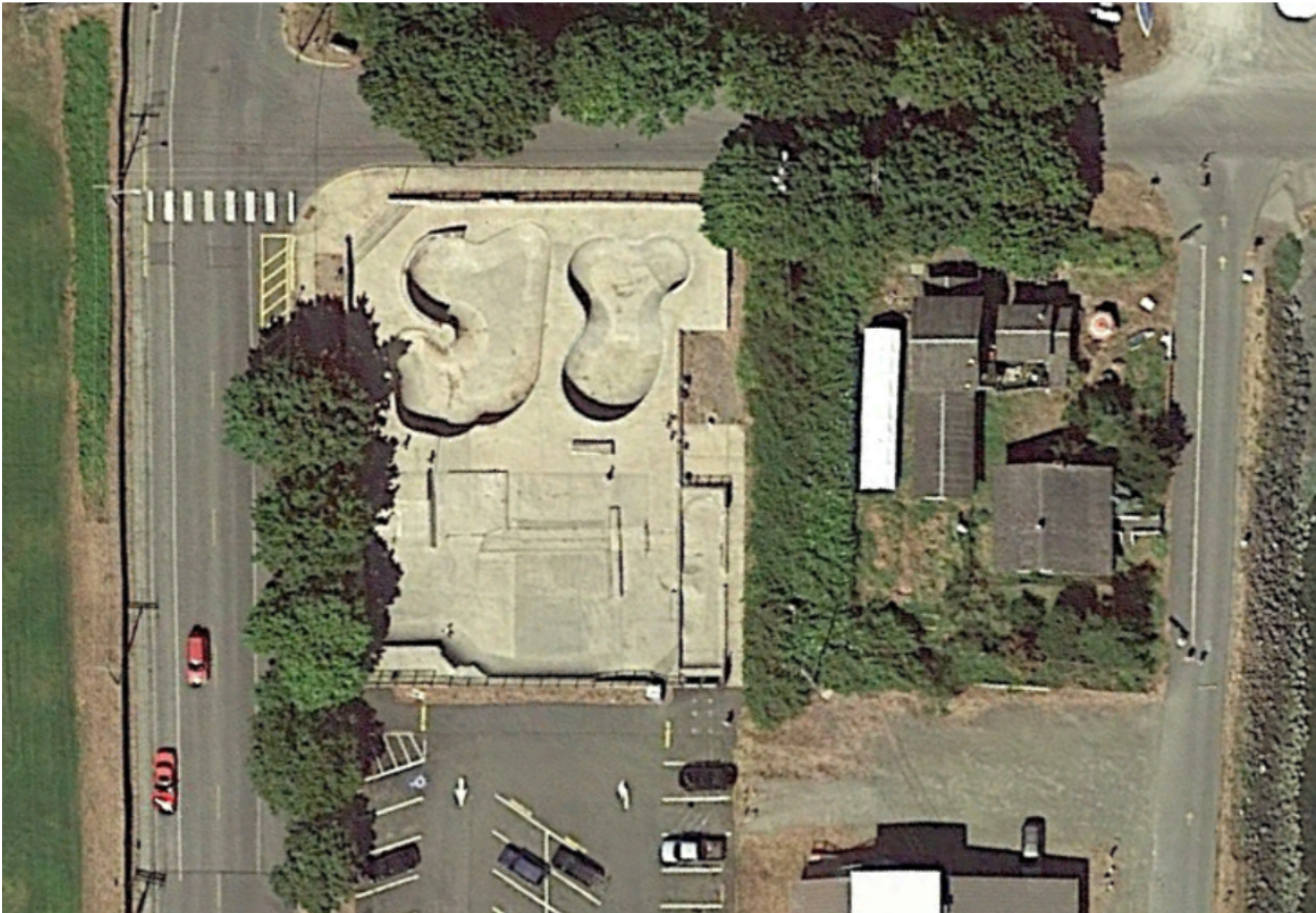
Skate Park Close-up View