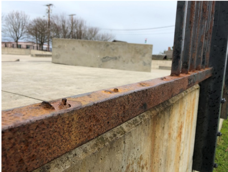
Photo of Typical Corrosion

Typical Fence Panel Consists of: 1"x1" square tubing at 4 inches on center, 2"x2" top and bottom rails, 5"x5" posts. Posts are approx. 60" on center Typical panels are 40" in heights except in transition locations. All metal is 1/16 - inch thick metal