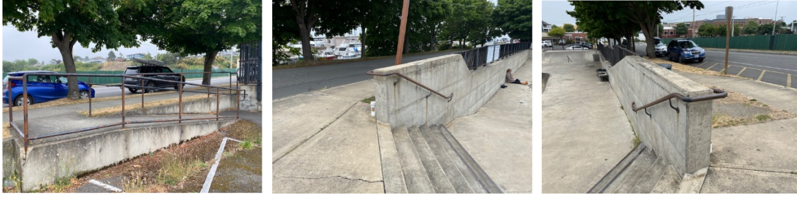
Hand Railings to be Included in Project