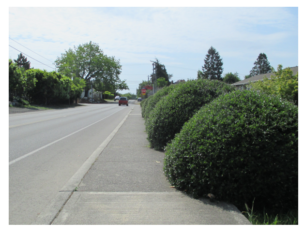
Unmaintained sidewalk blocks pedestrian and wheelchair access.