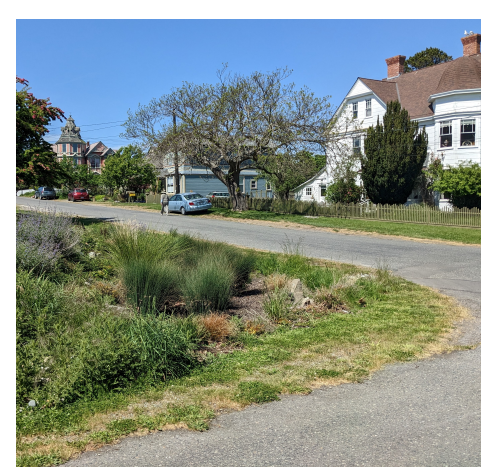
Rain garden with low vegetation allows for clear sight lines at intersection.

A no fee ROW Tree Permit is required to plant, prune, or remove trees in a ROW.