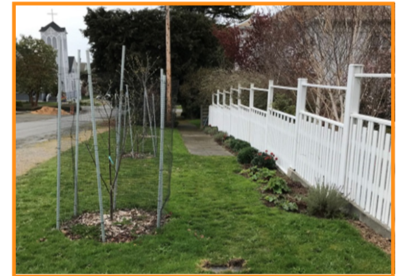
Temporary fencing around fruit trees in the ROW

While permanent fences are prohibited in the right of way and must be located on the property, temporary protective fences may be used, for example, around small trees and landscaping to keep deer out until plants are established.