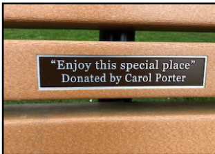
Etched Plaque 2x10" $375.00

If ordering memorial plaque, add text here. 2 lines, text size based on number of letters: