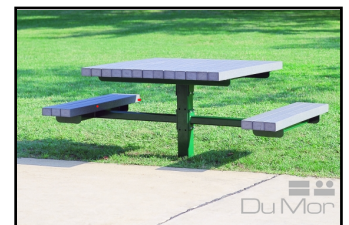
Picnic Table w/ ADA Options 4' square table $4,625.00

*Note: plaques are for new bench and table purchases and cannot be added to existing park benches or amenities