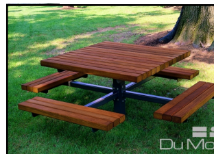
Picnic Table 4' square table $4,625.00