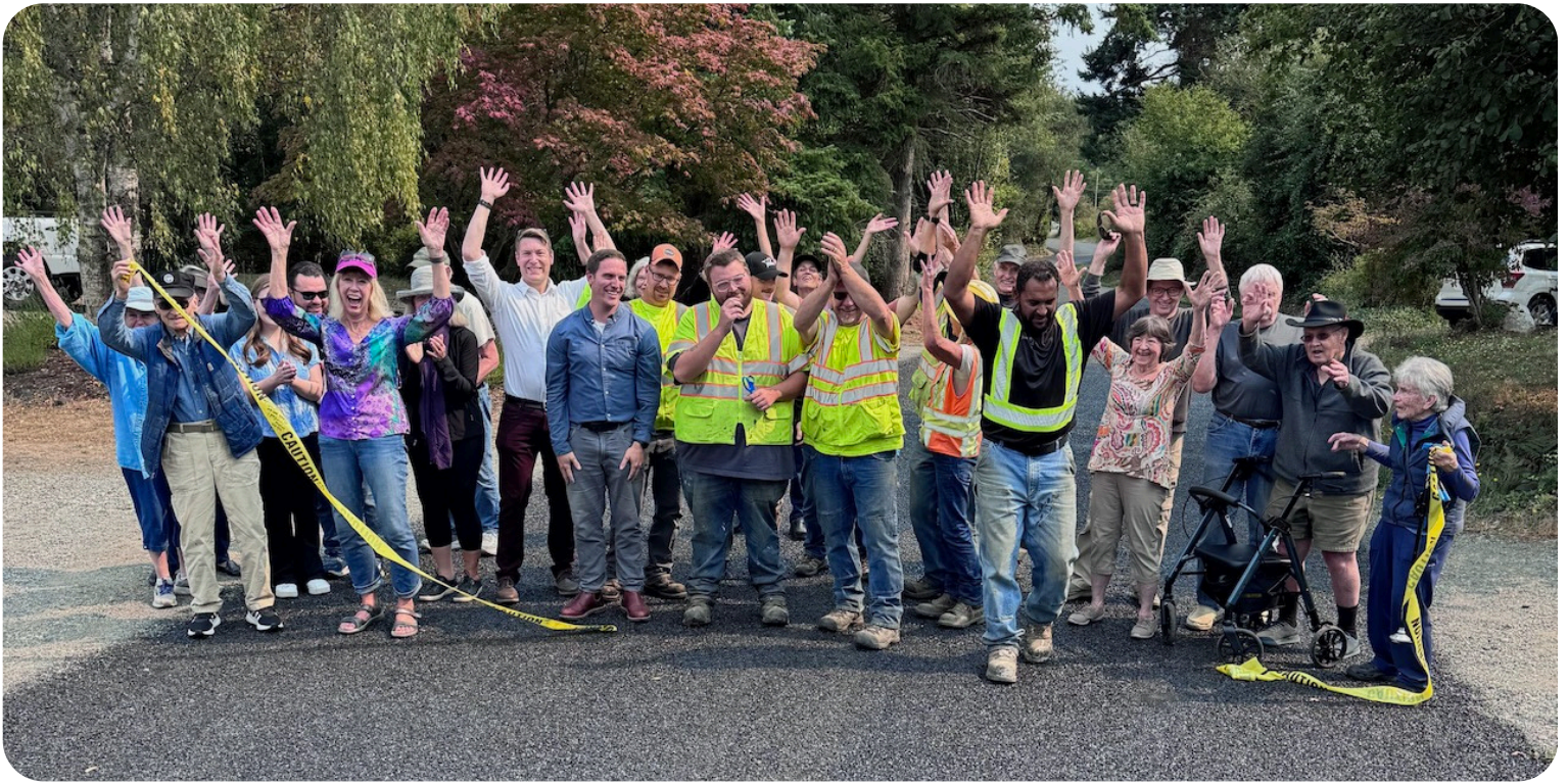
25th Street Ribbon Cutting in September 2025.