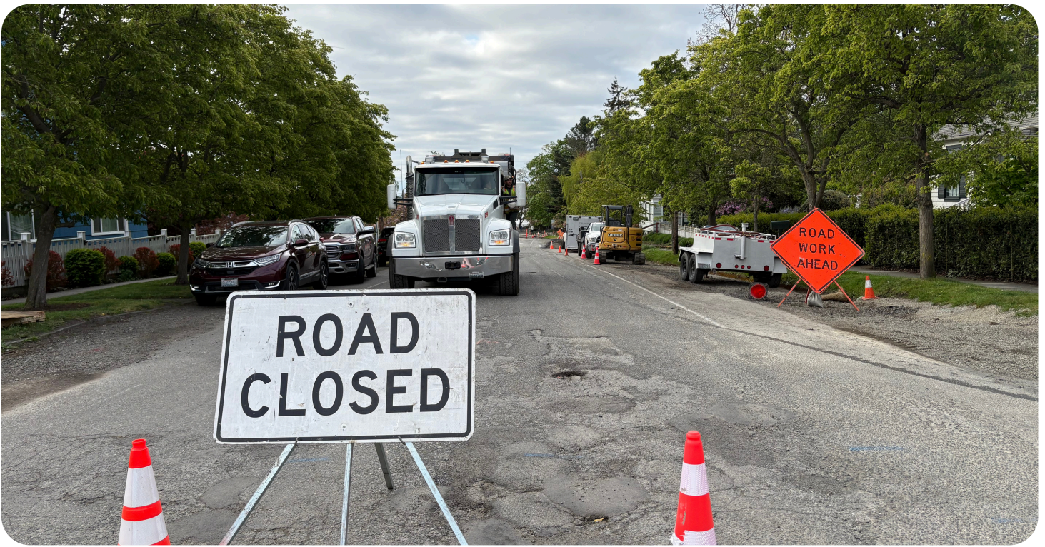
Tyler Street repairs underway.