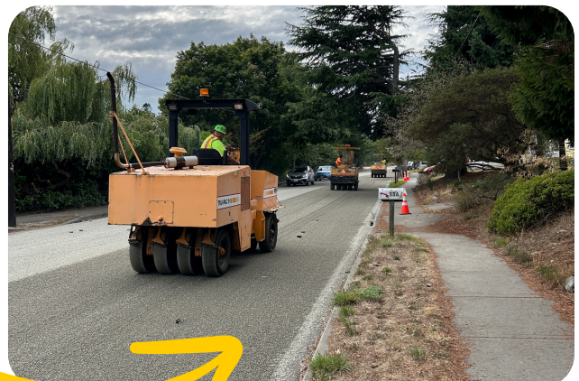
Chip seal on F Street.