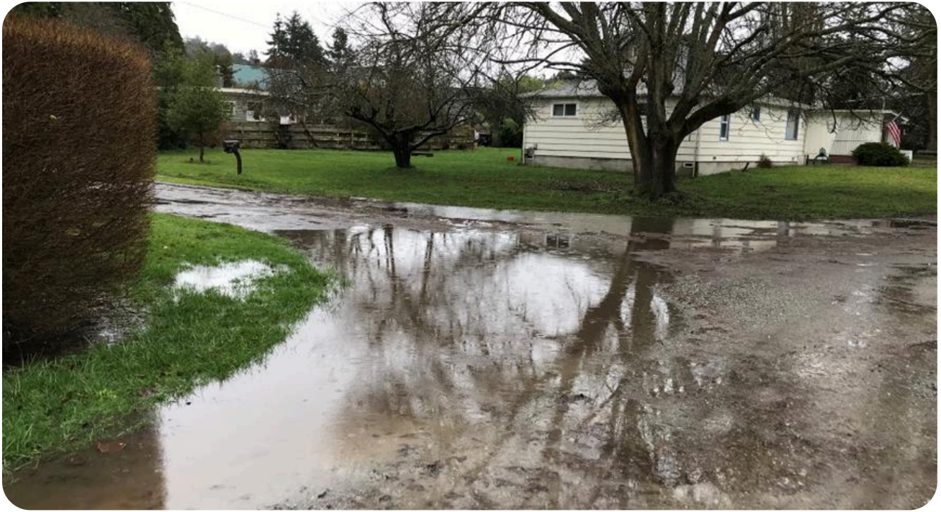
Drainage issues along Pacific and Milo Streets.