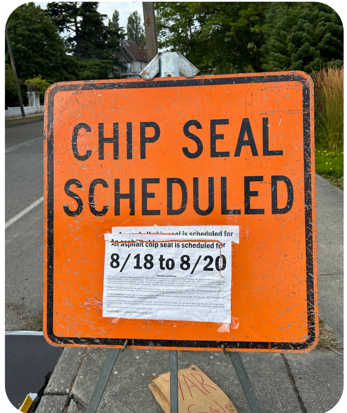
Summer 2025 included a significant chip seal effort.