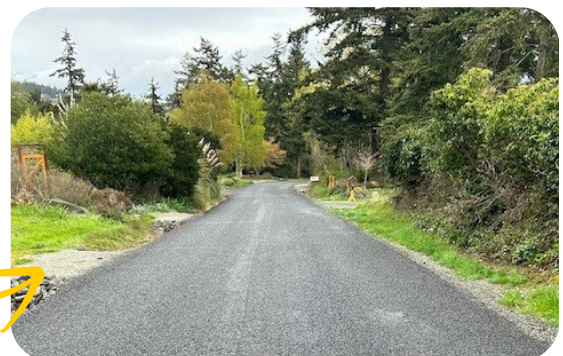
25th Street after chip seal.