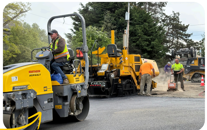
Paving Tyler Street.