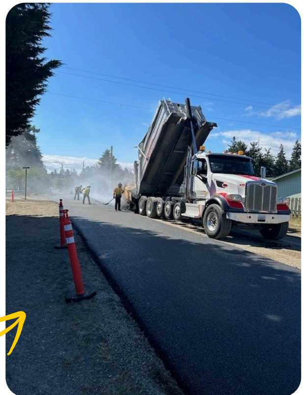
Paving Hancock Street.