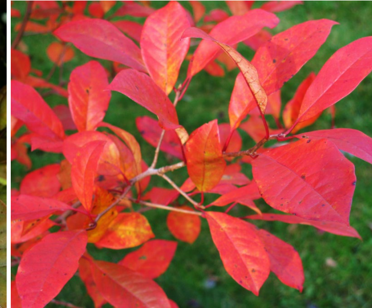
* Magnolia x 'Elizabeth' Elizabeth Magnolia [* Possibly a marginal species for this site] [Height: 18 feet, Spread: 15 to 17 feet]