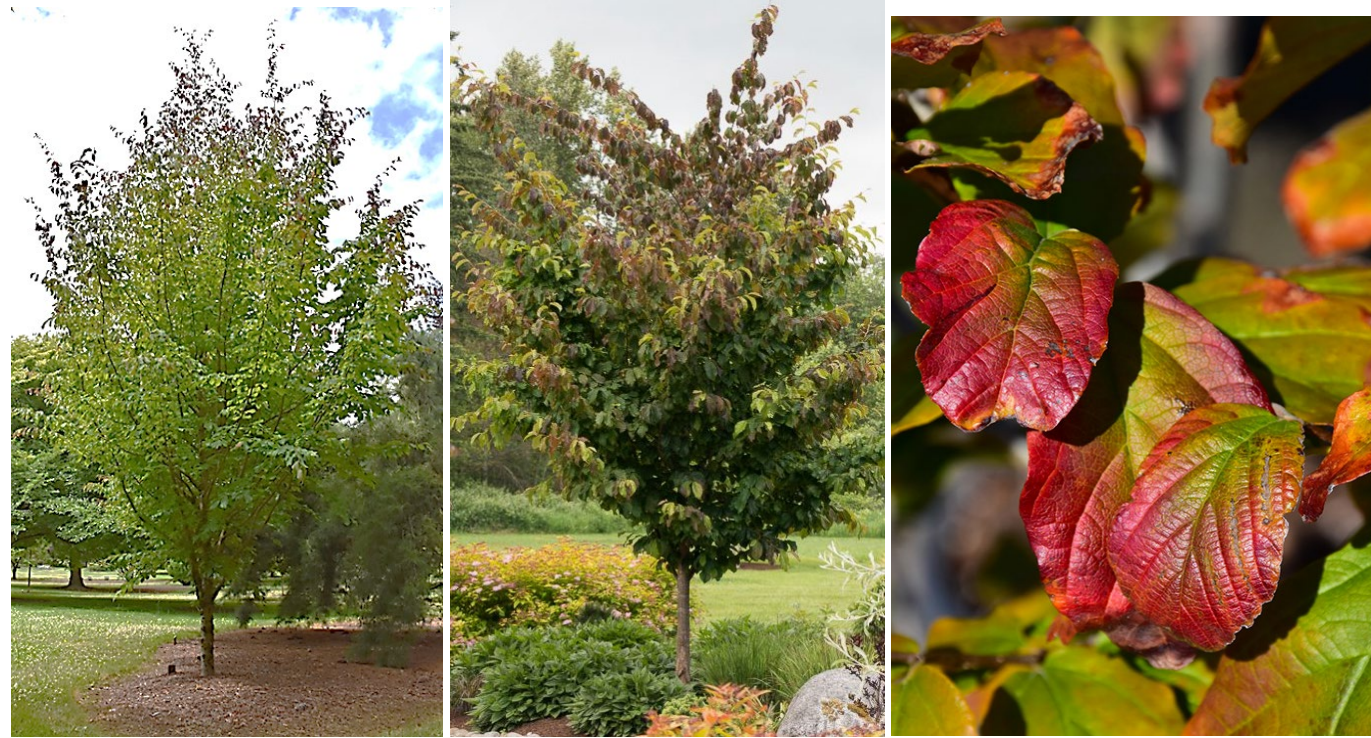
Quercus coccinea Scarlet Oak [Height: 50 to 80 feet, Spread: 45 feet]