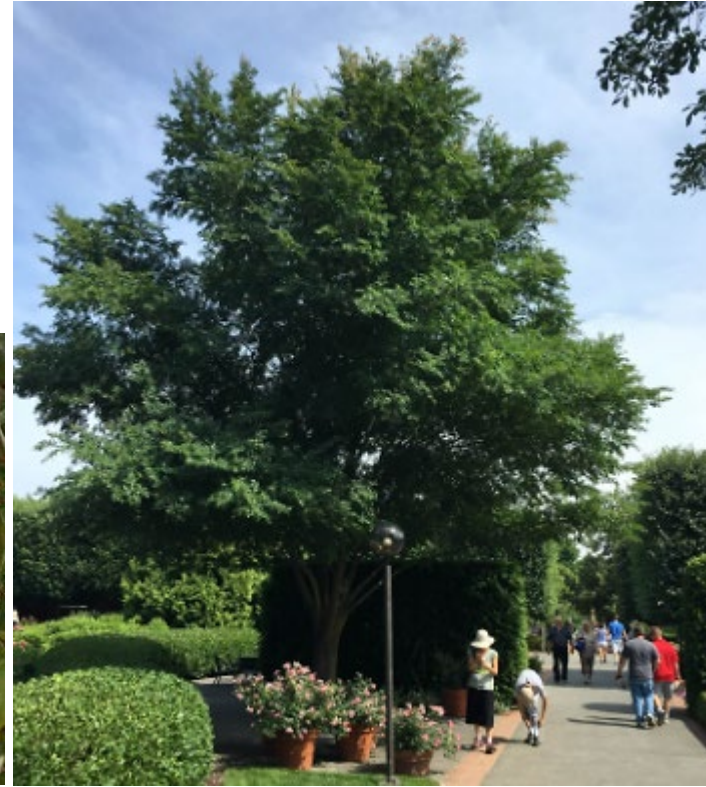
Taxodium distichum 'Lindsey's Skyward' Lindsey's Skyward Bald Cypress [Height: 18 to 20 feet, Spread: 6 to 10 feet]