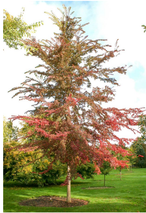
Ulmus carpinifolia x parvifolia 'Frontier' Frontier Elm [Height: 30 to 40 feet, Spread: 20 to 30 feet]