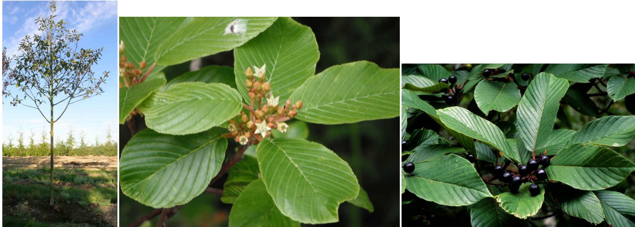
Quercus robur x bicolor 'Nadler' Kindred Spirit Oak [Height: 20 to 40 feet, Spread: 10 to 15 feet]