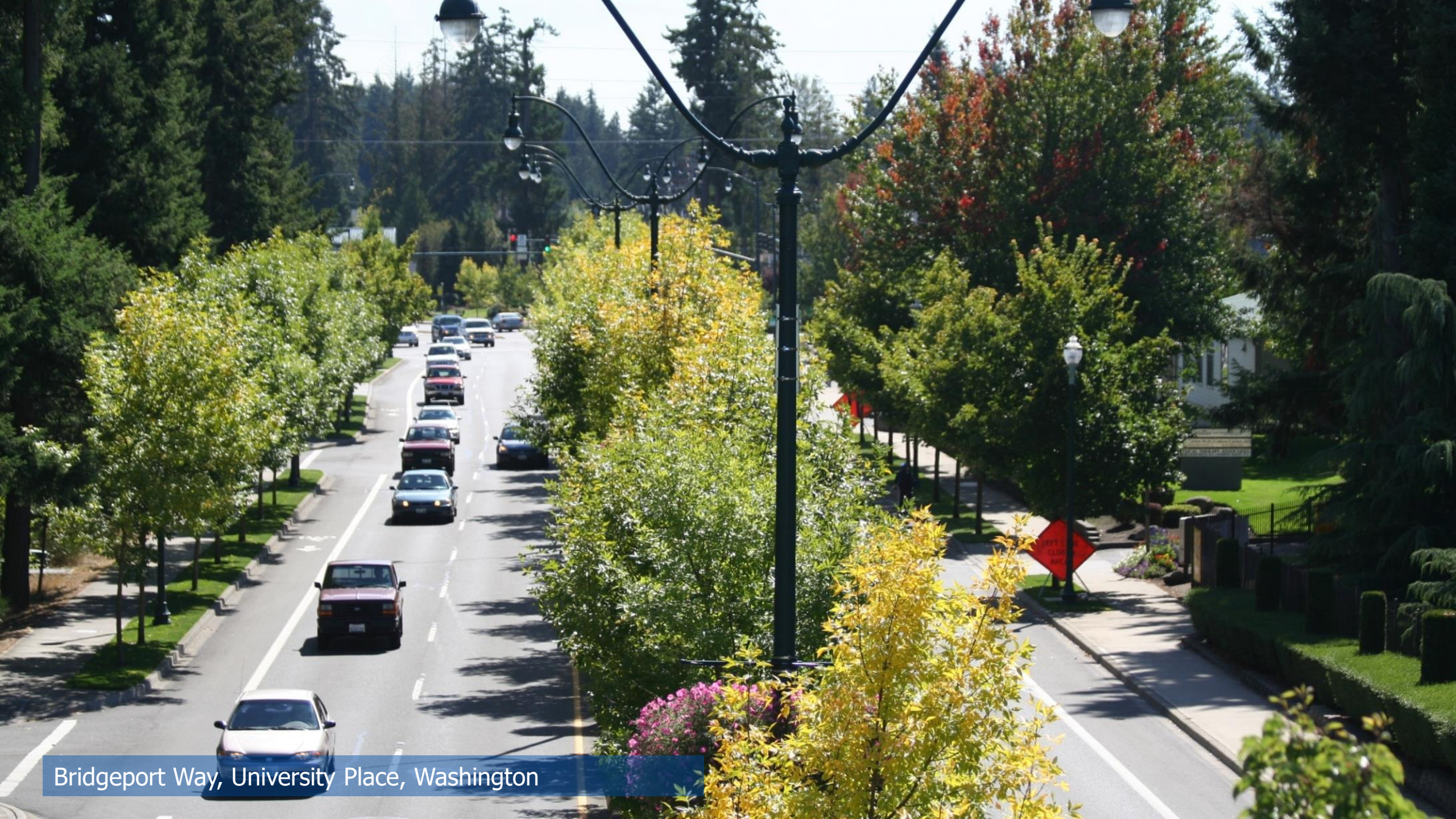
Bridgeport Way, University Place, Washington