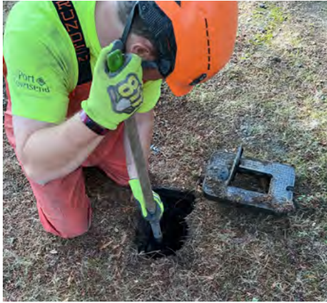
Water Resources crew member, Ricky Talbot, digging in a meter box to expose a service line for inspection.