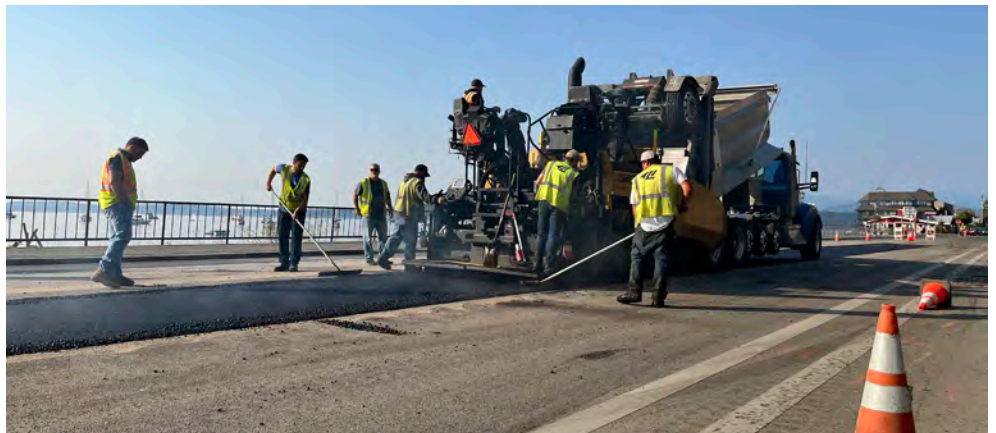
Contractors paving after the emergency repair of the Water Street sewer main in early September. The repair occurred in record time, minimizing traffic disruption for Wooden Boat Festival weekend.

The work is being planned for minimal impact and has been scheduled during a slower traffic season for Port Townsend and may require temporary road closures with a detour along Washington Street. Site work will include traffic control and noise mitigation. Questions regarding the Water Street Sewer Replacement Project should be directed to Project Manager Andre Harper, aharper@cityofpt.us . Additional details will be made available once the project schedule is determined in December.