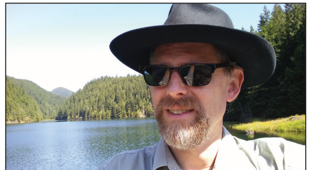
Collecting water samples at Lords Lake Reservoir

I am the Lead Operator for the City's Drinking Water Treatment Facility. I work with a team of certified operators to maintain our state-of-the-art membrane treatment system and ensure that high quality water is delivered to our customers. Some of my day to day includes: being on-call 24/7, providing contact with State and Federal agencies related to watershed issues, and developing and administering public education programs related to drinking water and the municipal watershed.